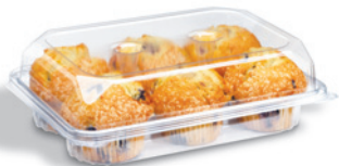
Dimensions™ Bakery Containers

For virtually any retail food environment—grocery stores, delis, quick marts, restaurants, cafeterias, food carts and beyond—Placon provides thermoformed packaging products for superior performance. Efficient storage, secure sealing and exceptional functionality all play a role in our industry-leading designs. Polypropylene and PETE options mean our packaging can accommodate virtually any food product, any use, any environment. And from environmental perspectives, our EcoStar® food-grade recycled PETE (with up to 100% post-consumer recycled content) is just a taste of things to come.