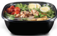
Fresh 'n Clear™ Scround Bowls and Lids