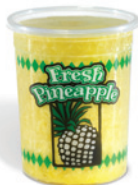
HomeFresh® Pineapple Container