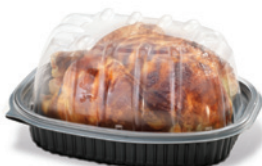
HomeFresh® Rotisserie Chicken Container